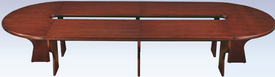
Includes built-in center cord-drop area shown without cover panels.

Modular table components allow you to build tables as long as you want!